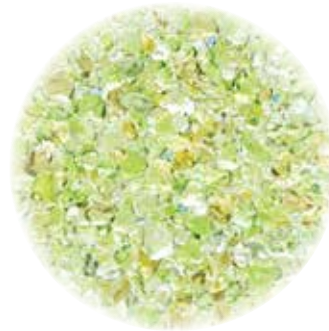
Grade 1 0.5 - 1.0mm (equivalent to Grade 16/30 sand)